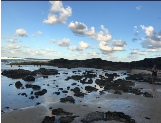
Frazer Island, Champagne Pools